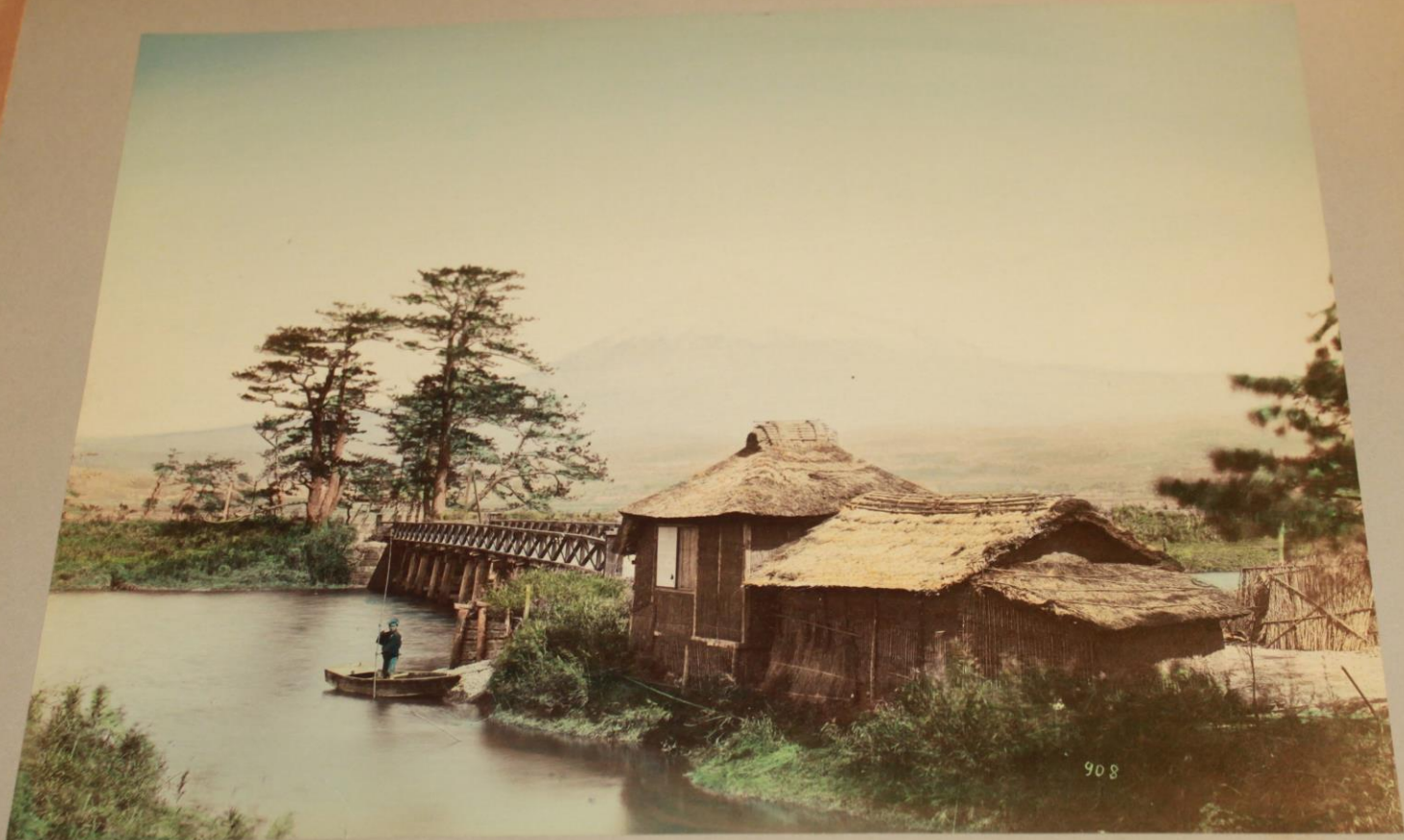
Tokaido - road - Kawaibashi from Fujiyama