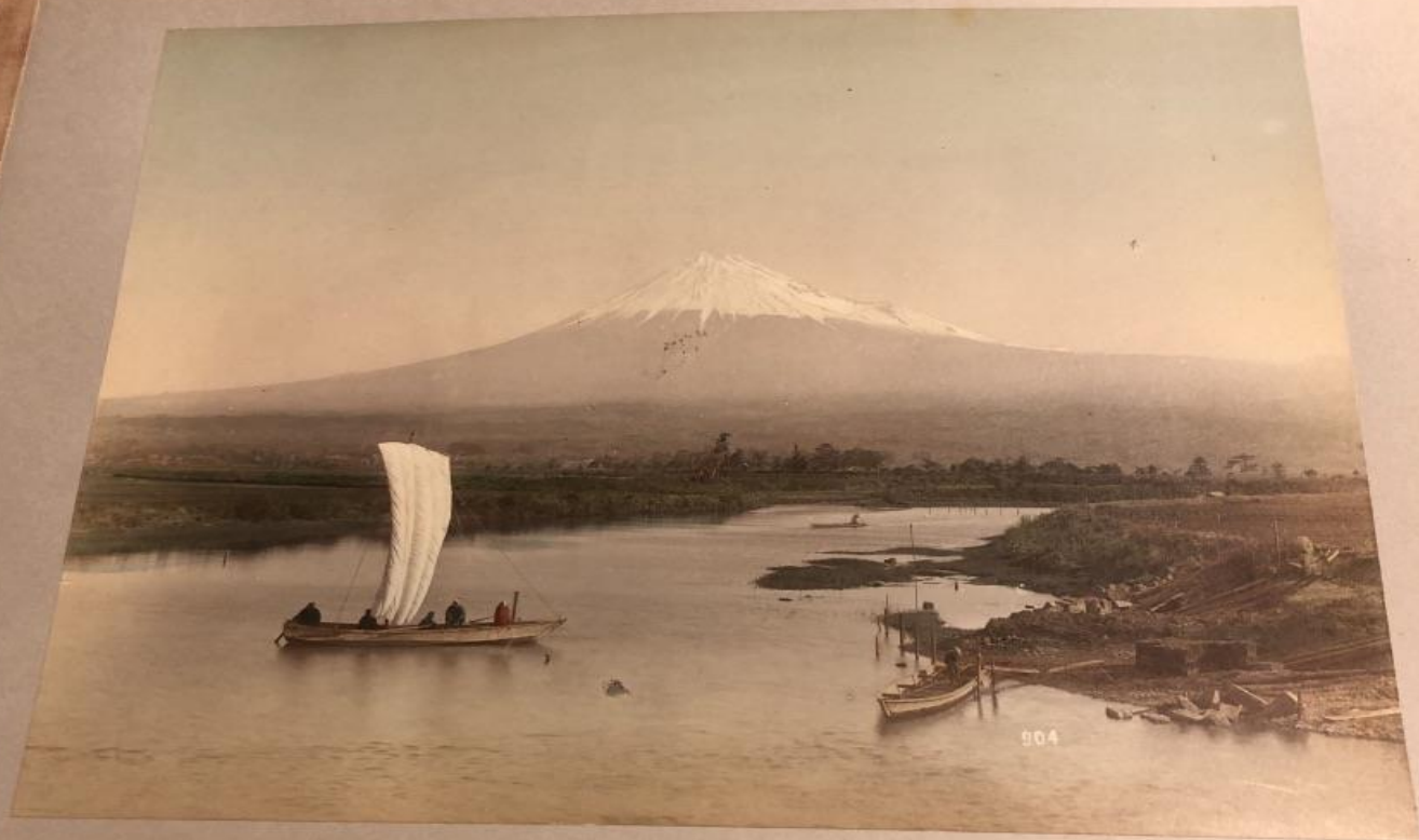
Fujisan from Kumagawa River.