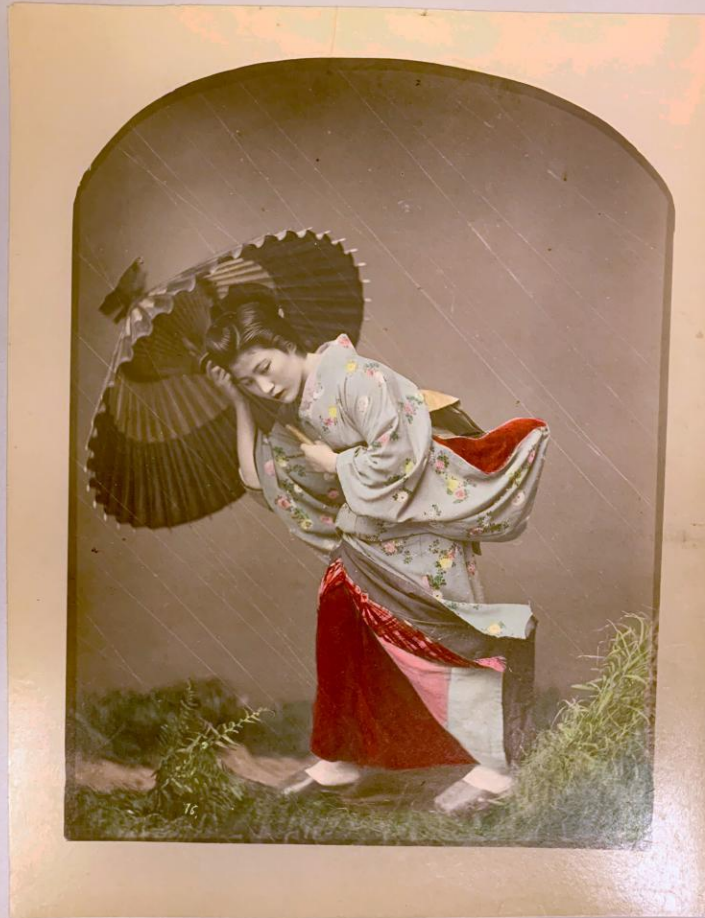
Girl in Rain Storm