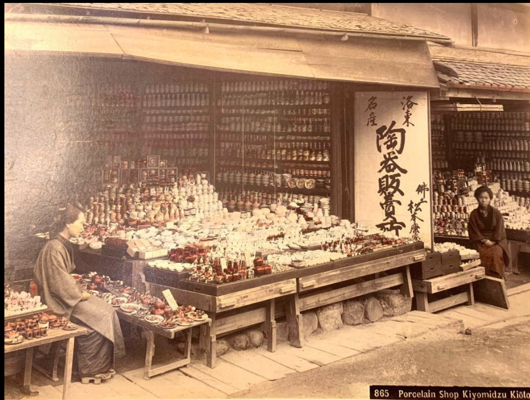
865 Porcelain Shop Kiyomidzu Kyoto.