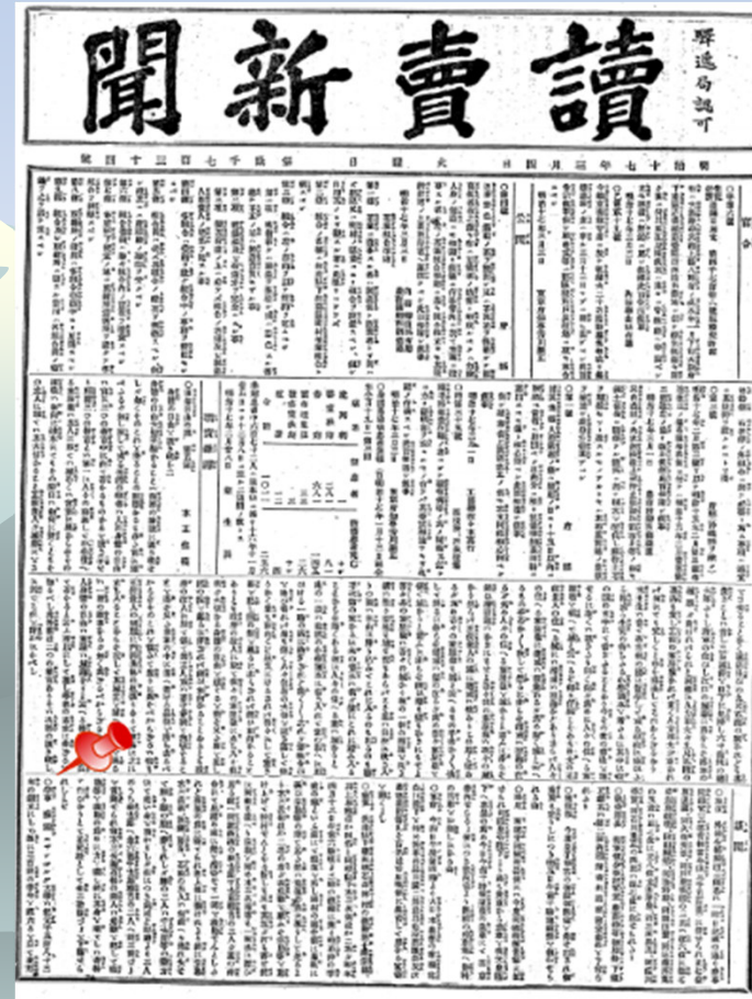
Top page of 4 Mar. 1884 says Edinburgh University holds 300th anniversary celebration