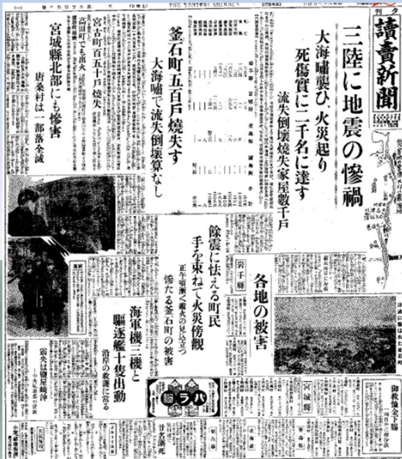
(Top page, Evening Edi., 4 Mar. 1933)